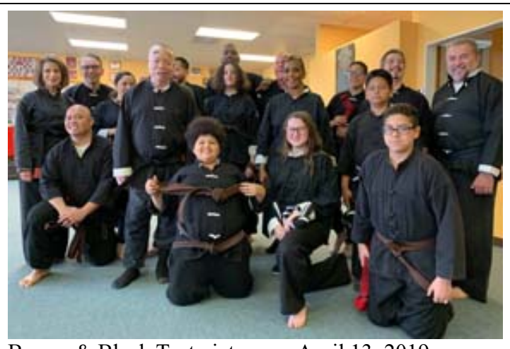
Brown & Black Test picture on April 13, 2019

07/04/2019 - 07/06/2019 - NO CLASS DUE TO INDEPENDENCE HOLIDAY.