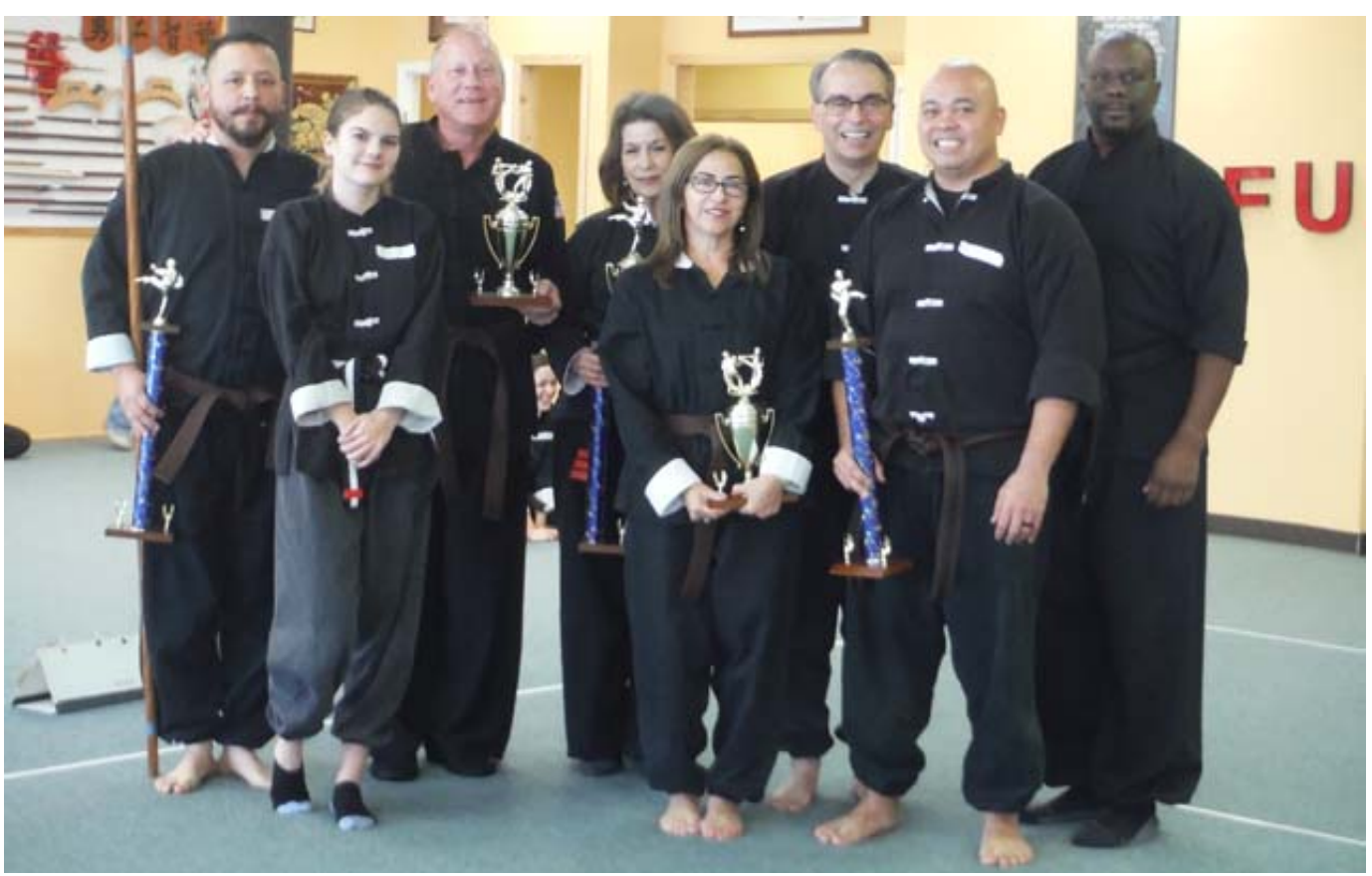
Inner-school Tournament picture on February 23, 2019.