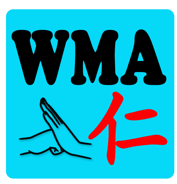
Wangs Martial Arts

App code: 2816823387 (no spaces or special characters)