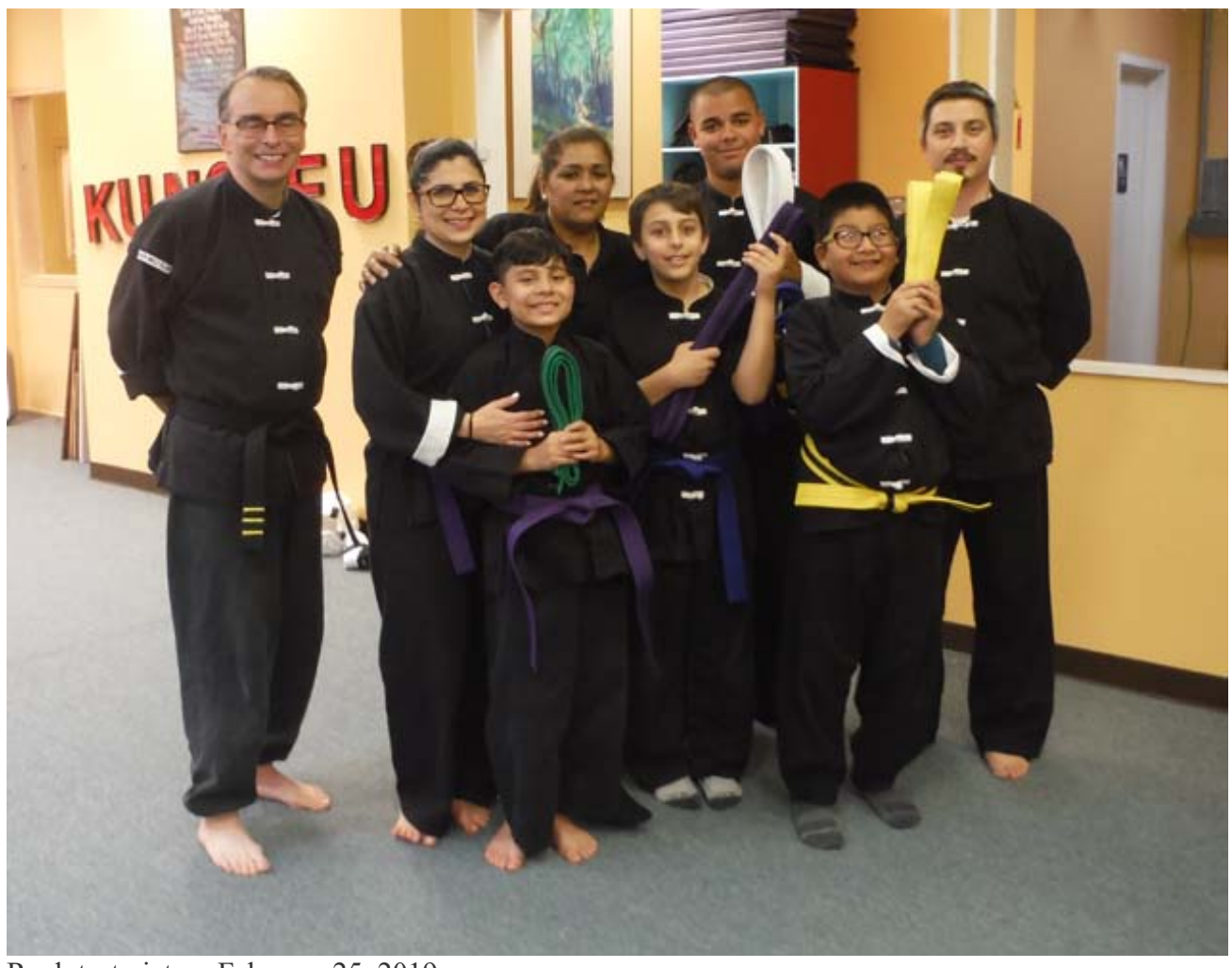
Rank test picture February 25, 2019.