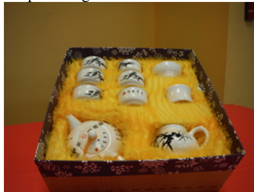
4th prize: Big Tea Set