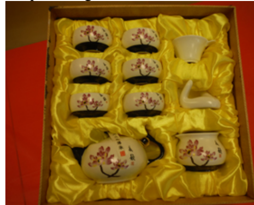
3rd prize: Big Tea Set