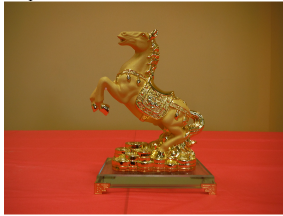
6th prize: Gold Horse