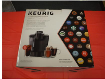
2nd prize: Keurig Coffee Maker