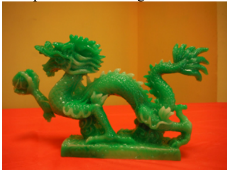
10th prize: Green Dragon