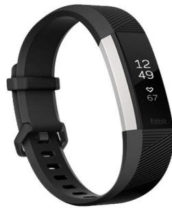
2nd prize; Activity Tracker