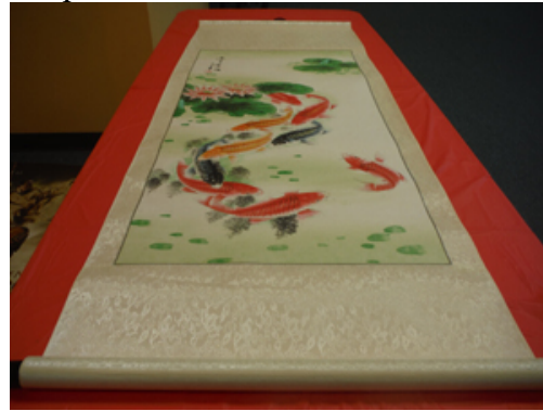
5th prize: Picture Scroll