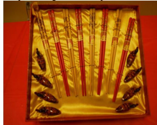
6th prize: Big Set of Chopsticks