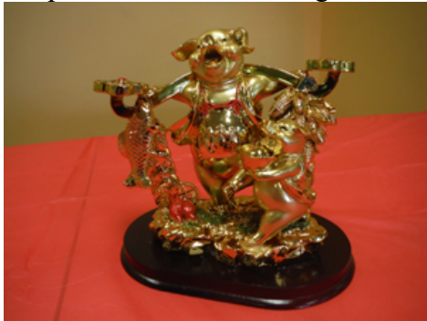
4th prize: Small Golden Pig