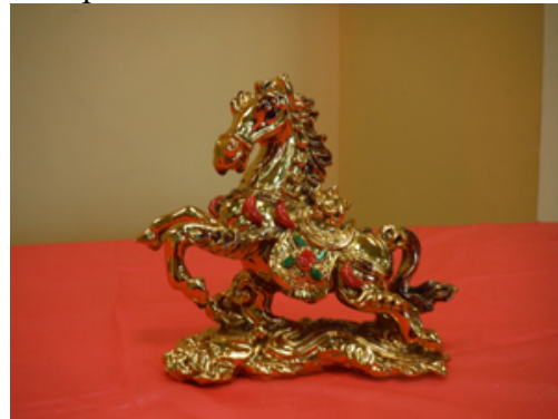
11th prize: Small Golden Horse