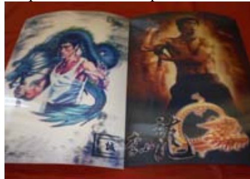
8th prize: 2 Bruce Lee pictures