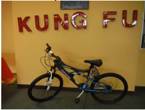
1st Prize: Bicycle