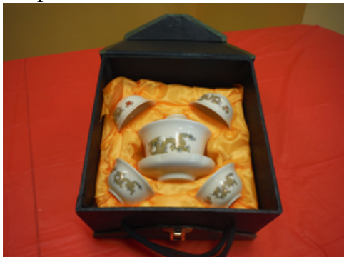
7th prize: Small Tea Set