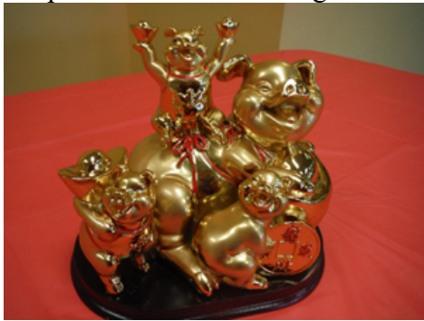
7th prize: Small Golden Pigs