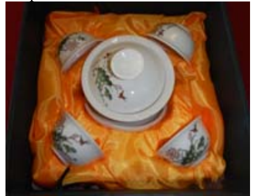
9th prize: Small Tea Set