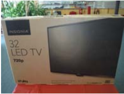
1st Prize: 32" LED TV