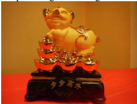
3rd prize: Big Golden Pig