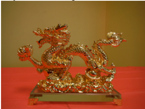
5th prize :Golden Dragon