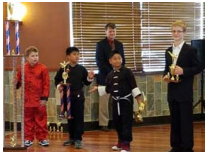
Chinese New Year celebration - February 10, 2018.