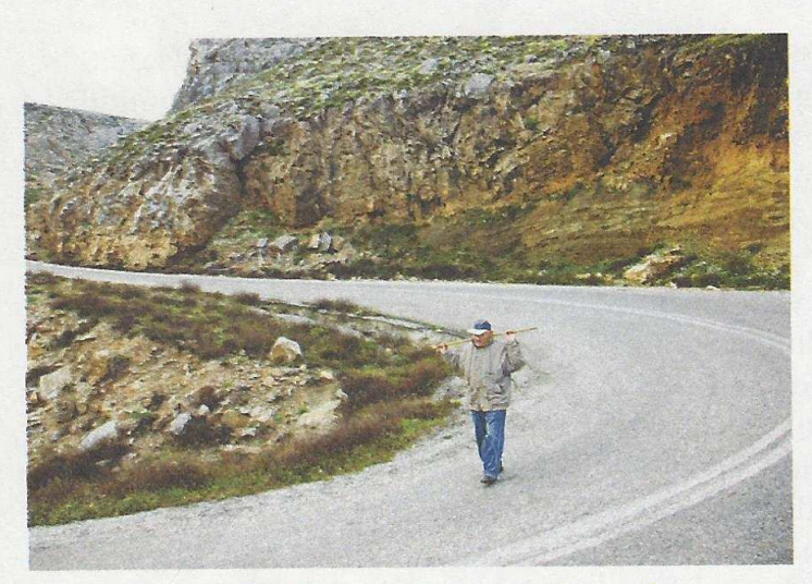
This 99-year-old Ikarian man takes a three-mile walk uphill every day to tend goats.

likely as their American counterparts to reach 90. Ikarians were also living about eight to ten years longer before succumbing to cancers and cardiovascular disease, and they suffered less depression and about a quarter the rate of dementia.