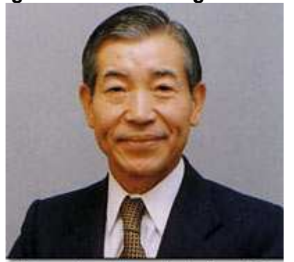
"The unstoppable contamination of the Pacific Ocean and the atmosphere... is seriously menacing the West Coast of the United States."

Deteriorating situation in Fukushima — Japan is laboring under the consequences of the Accident never before experienced by humanity, including the simultaneous destruction and meltdown of three commercial nuclear reactors. Four and half years after the 3.11 disaster, it has been shown that a severe nuclear accident cannot be brought under control by a single state... It is questioned if Japan is in possession of the governability and the capacity needed to cope with the impending crisis. The melted cores of the reactors from Units 1, 2 and 3 remain inaccessible... If the molten nuclear fuel rods are exposed through cracks to the atmosphere due to a mega earthquake or the liquidization of soils on the site that could cause the collapse and breach of Fukushima's spent fuel pools, Japan's landmass would become uninhabitable to a large extent... The whole of Japan is threatened by the worsening situation emanating from the molten fuel rods, which continue to widely disseminate large amounts of dangerous radionuclides into the sea and atmosphere.