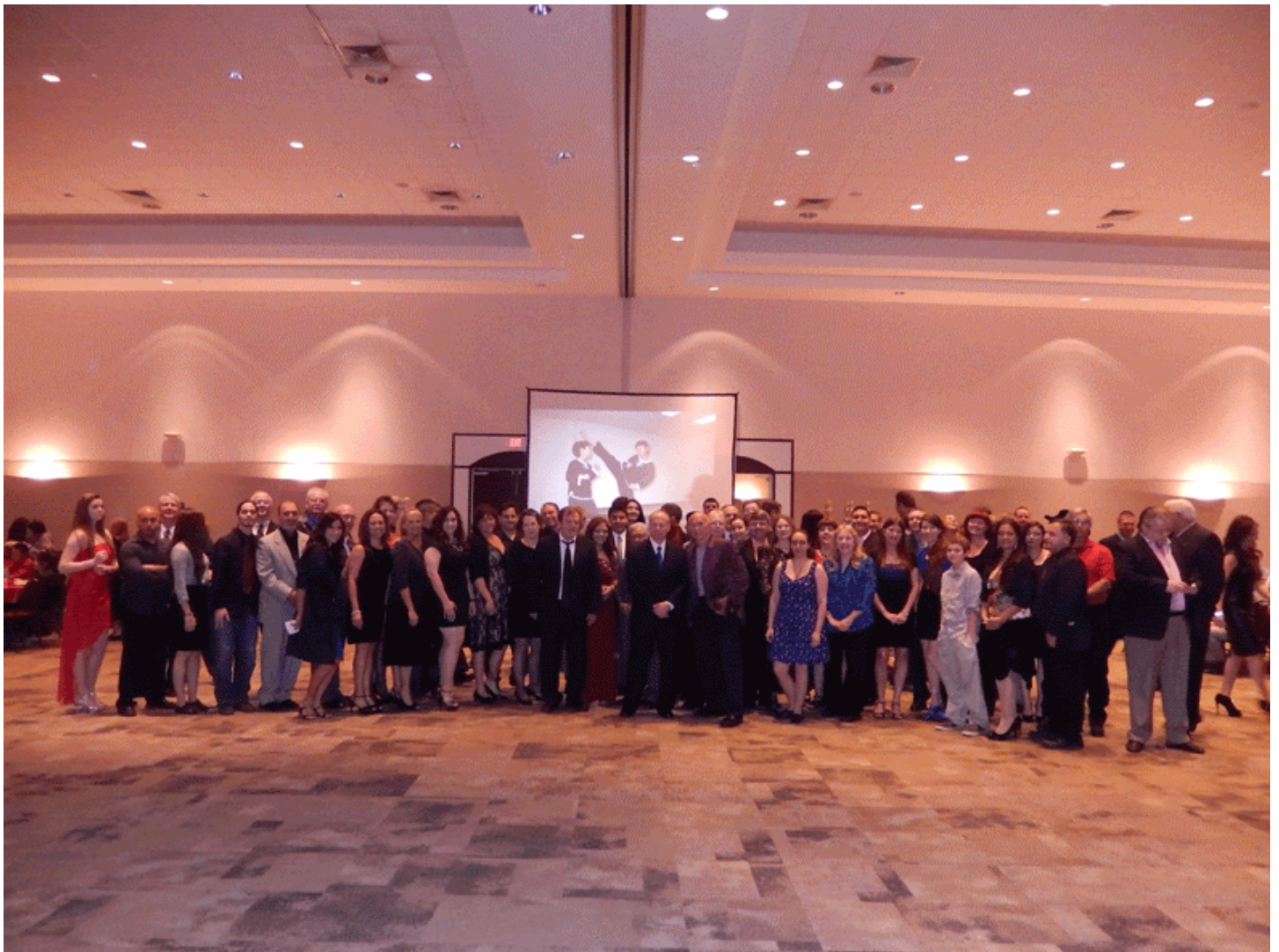
ASK group picture. Master Bill Gray & Grandmaster Bill "Superfoot" Wallace (center).

For the benefit of everyone's health, eat vegetables, fruits, grains and be kind to all animals. World Peace is possible and can be achieved.