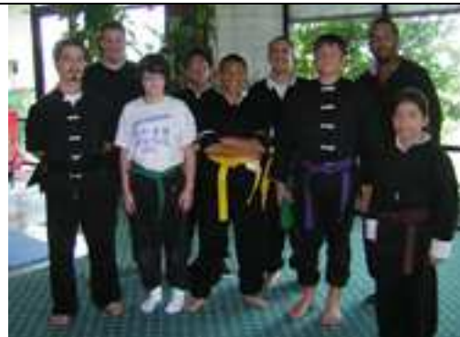
Kung Fu Rank Test on 7/29/13.

Black Belt club & Accelerated program rank test: