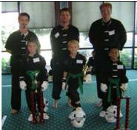
Inner-school tournament on 8/10/13

" Those who work their land will have abundant food, but those who chase fantasies have no sense."