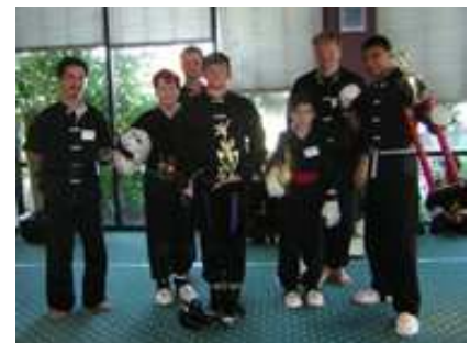
Inner-school tournament on 8/10/13