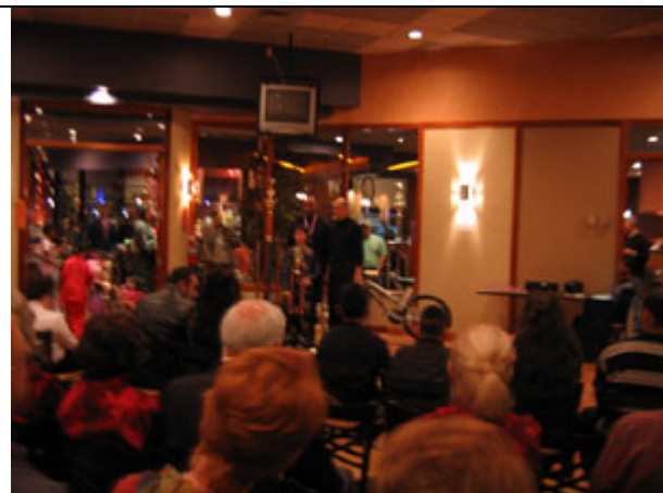
Chinese New Year program