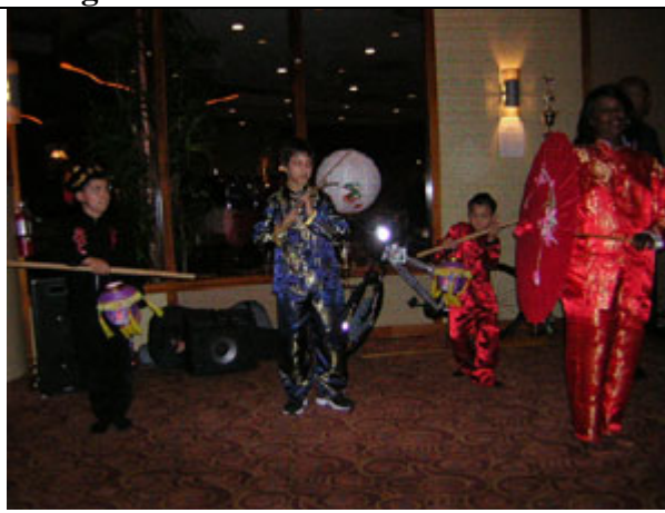
Chinese Fashion show.