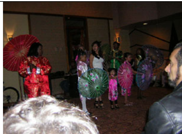
Chinese Fashion Show.